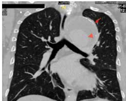
Figure 2. A coronal view of contrast-enhanced computed tomography demonstrates aneurysm from the arch to descending thoracic aorta associated with mural thrombus measuring 3.1 cm at its maximum thickness (arrowhead) as well as peripheral calcification (arrow)