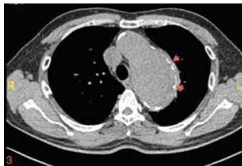
Figure 3. An axial view contrast-enhanced computed tomography shows a huge aneurysm from the aortic arch to descending thoracic aorta with peripheral calcification (arrow)