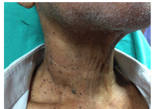
Figure 1. Fullness of the right neck at Level III

The patient was alert and conscious and oriented to time and place. All cranial nerves were intact. The oral cavity and oropharyngeal examination was unremarkable. The neck examination revealed a fullness on the right Level III measuring 4 cm x 3 cm ( Figure 1 ). There were no skin changes and the fullness was not tender and soft on palpation. However, during the palpation of the mass, the patient developed bouts of coughing. Otoscopy and nasoendoscopy showed normal findings. On examination of the larynx and hypopharynx, all structures were normal, and the bilateral vocal cords were mobile.