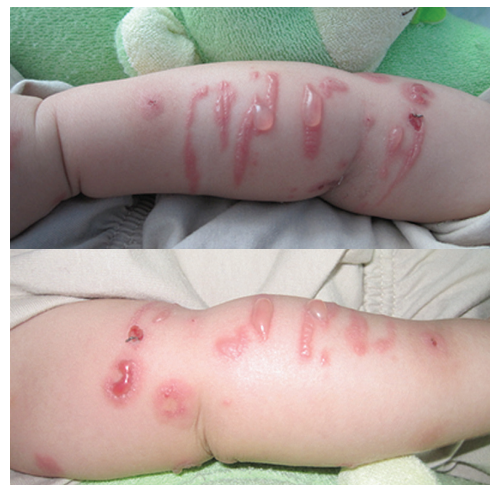
Figure 2. Clear and haemorrhagic blisters on linear erythematous plaques encircling the right upper limb