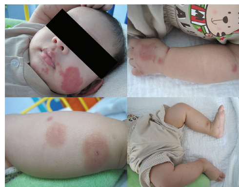
Figure 1. Erythematous, non-blanching and indurated papules and plaques on the cheeks, left hand dorsum and bilateral lower limbs

A 5-month-old Malay boy presented with fever for 4 days duration accompanied by cough, loose stool, purpuric skin lesions and bilateral lower limb swelling. Three days prior to the onset of illness, the child received his third dose of diphtheria, tetanus and polio (DTP) vaccination. Before coming to the hospital, his mother had brought him to a general practitioner who prescribed him antipyretics and antimicrobials. The skin lesions appeared prior to the commencement of antimicrobials. Starting with purpura on the right ear pinna, the lesions rapidly extended to the upper and lower limbs and finally the face. Papules on the cheeks and lower legs quickly evolved into large and tender plaques. The child had no symptoms of irritability and there was neither haematuria nor haematochezia. He had no known medical illness and had a normal birth history. No other siblings were similarly affected.