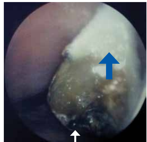
Figure 1. Rhinolith (white arrow) and septum (blue arrow) of the right nasal cavity upon endoscopy

mass was apparently seen on the floor of the right nasal cavity. Nasoendoscopic examination revealed a mass occupying the space between the inferior turbinate and septum in the right nasal floor (Figure 1). The mass was dark in colour with mucus overlying it. It was stony hard and gritty in consistency on probing. These findings were consistent with right rhinolith. The left nasal cavity was normal. The rhinolith was completely removed by application of local anaesthesia as outpatient (Figure 2). On crushing the rhinolith, no obvious nidus was identified (Figure 3). The patient was then prescribed a course of oral antihistamine and nasal douching.