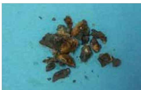
Figure 3. Crushed rhinolith